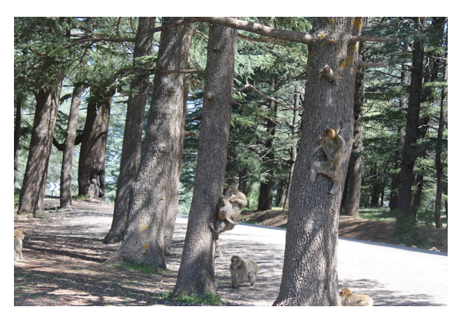
Fig. 2 CA (adult male) takes corpse of juvenile male into tree (centre of picture) (19/05/14)

On 19/05/14 at 14:00, a male juvenile (between 2–3 years old) was struck by a vehicle and instantly killed (struck in the head, one eye hanging out and jaw dislocated). The body was moved off the road by local merchants immediately following the collision. The group screamed and became extremely agitated, causing the merchants to abandon the corpse. One adult male, CA, took the corpse up a tree (Fig. 2). CA remained with the juvenile's corpse for over 30 min, before eventually dropping it to the ground. UR (sub-adult female) spent several minutes with the body on the ground. The body was guarded by group members (including CA and another adult male, GU) for approximately 80 min after the accident, including threatening and charging a park official who attempted to get close to the body. After the group moved away from the