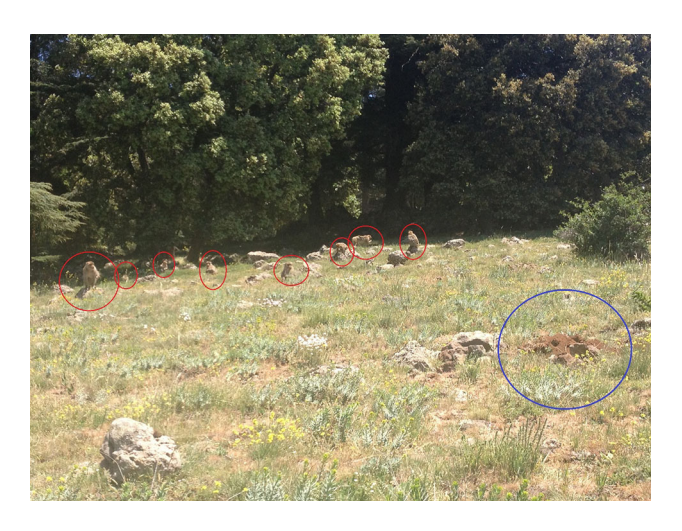
Fig. 3 Photograph showing group members following the corpse of the dead juvenile male to an exposed burial site. The monkeys of this group had previously never entered this exposed area. The blue circle highlights the burial site, the red circles highlight group members (19/05/14)

On 24/10/14 at 12:03, WE, the approximately 4-month-old infant of the female WA, was hit by an automobile, partially severing one leg. WA immediately carried WE, still alive at this point, into a tree and began grooming her. A sub-adult male (ME) approached the pair and teeth-chattered at them. At 12:25, while adjusting position within the tree, WE fell around 3 m to the ground. WA climbed down from the tree and dragged WE approximately 5 m, but she was displaced from WE by the presence of merchants, tourists, and dogs. WE continued to struggle on the ground, crawling on her arms, but succumbed to her injuries at 12:33. Table 2 in the supplementary material provides a